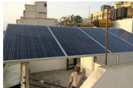
Bungalow Dhayri Pune 1KW