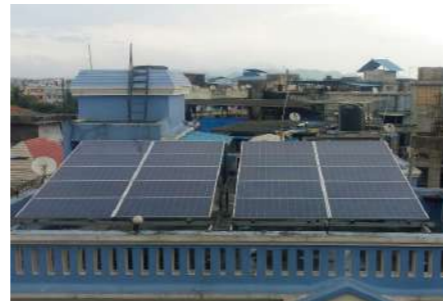
Bungalow Kasheli Thane 6KW