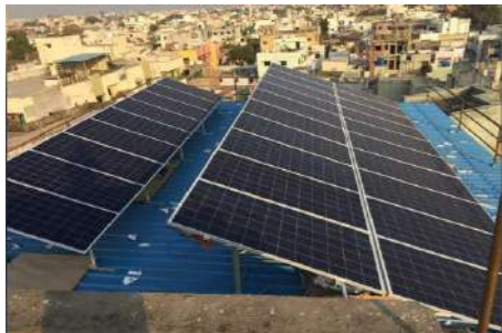
Chitnavispura Bank Nagpur 10KW