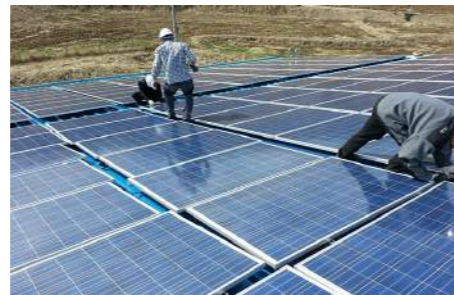
A K aluminium Raipur 100KW