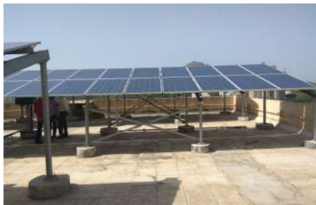
Supreme Pvt. Ltd. Vadodara 25 KW