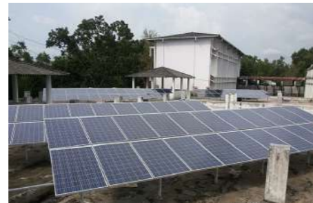
Zenom Engineering Allahabad 35KW